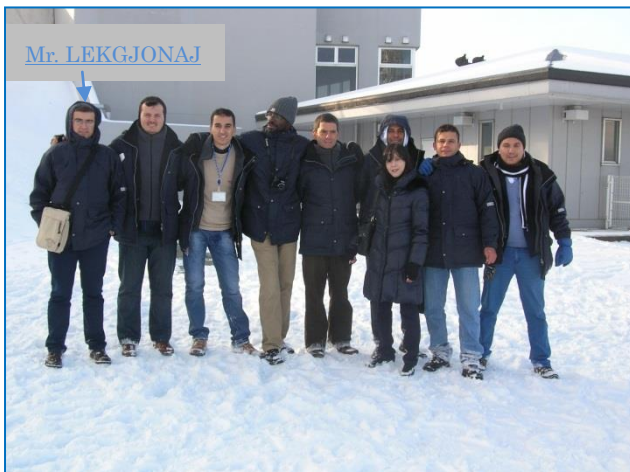
At Mt. Sarakura covered with snow