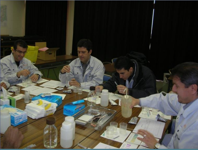
KITA participants devote themselves to their training.