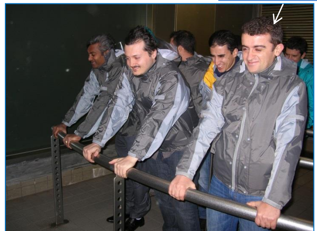
Storm simulation booth at Tokyo Life Safety Learning Center