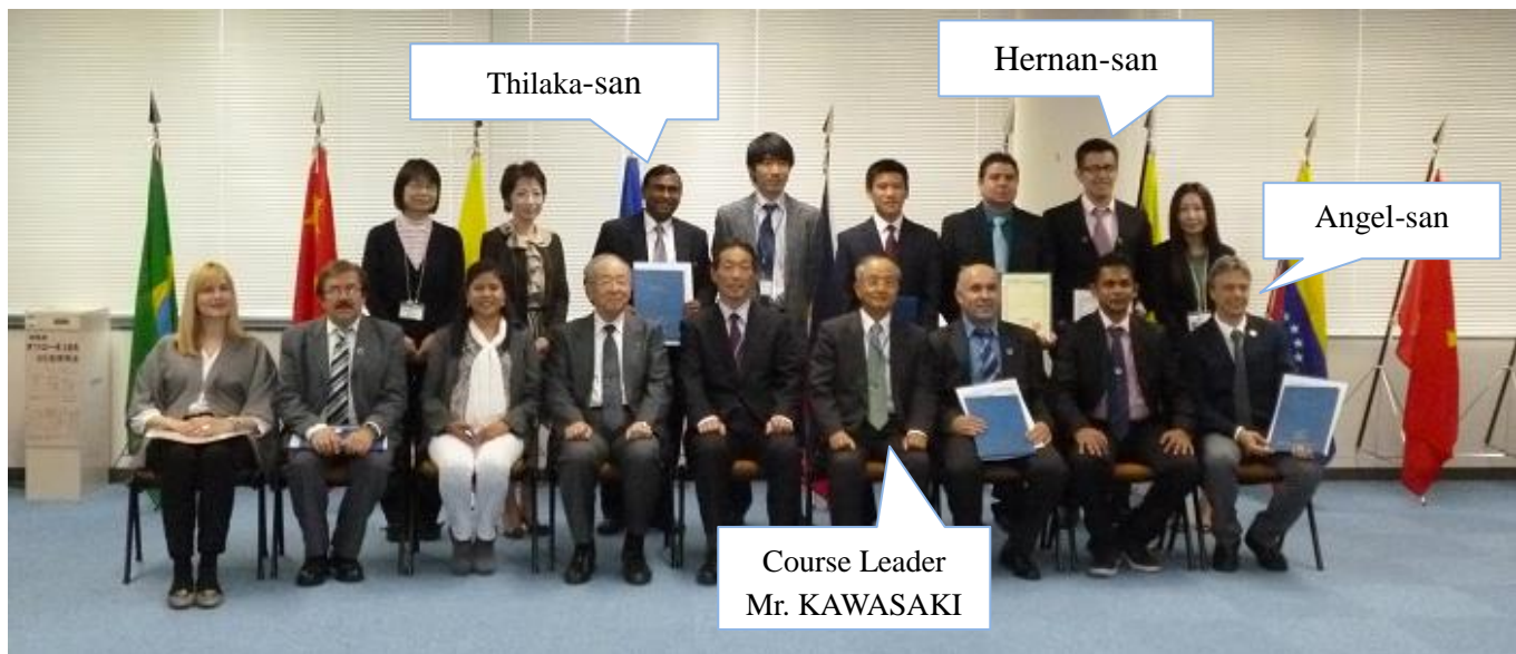
At the Closing Ceremony of “Industrial Pollution Control Management” in FY2012