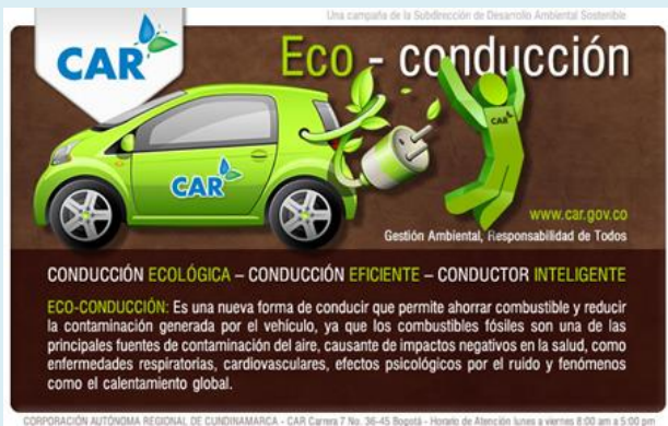
【A didactic material from a report by a participant from Colombia】