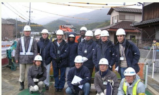
At a sewerage construction site