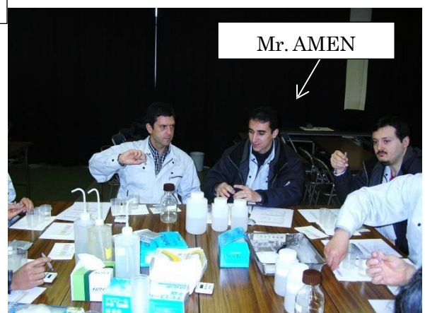
Practice of water analysis at the Hiagari Sewage Treatment Plant