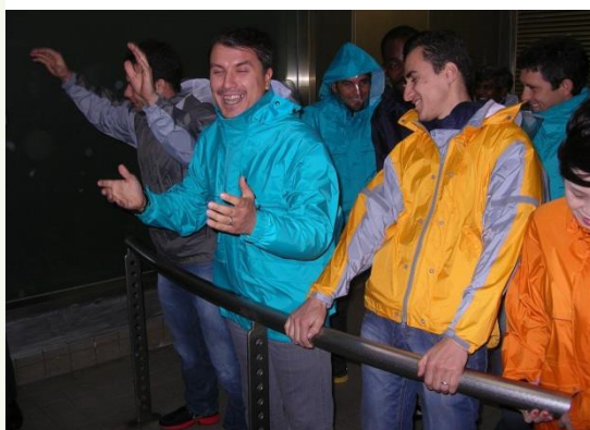
Storm simulation booth at Tokyo Life Safety Learning Center