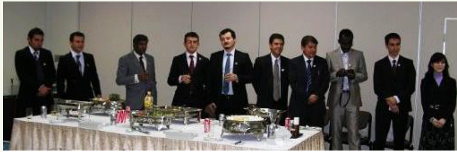
At the closing party