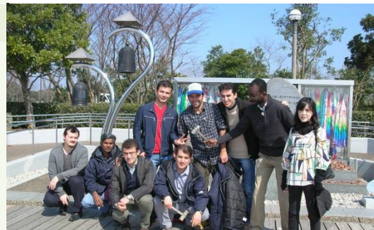
In front of the Minamata Disease Memorial Monument