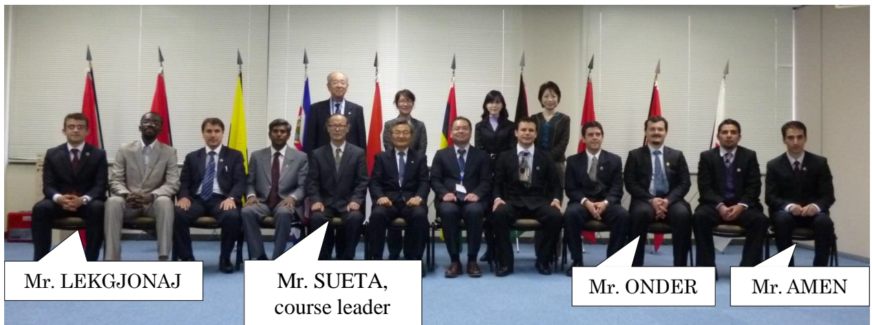
A memorial group photo at the closing ceremony of the training course, “Operation and Maintenance of Sewerage System and Waste Water Treatment Technique (B)” in FY 2012