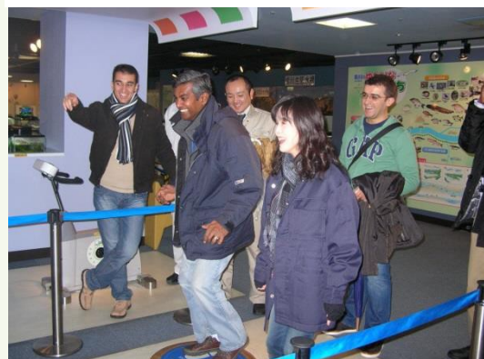
At the Environmental Museum of Water