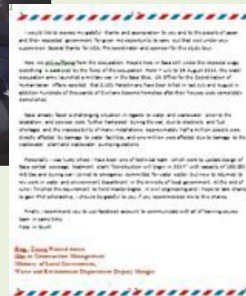
His E-mail (Recent News)