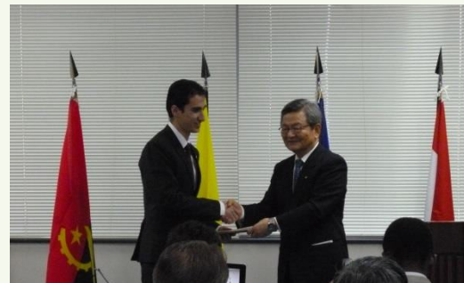
Receiving the certificate at the closing ceremony