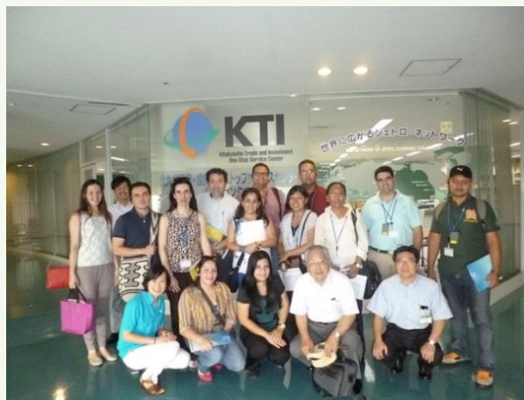
The participants on a field trip