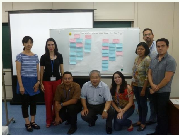
The participants at their studies