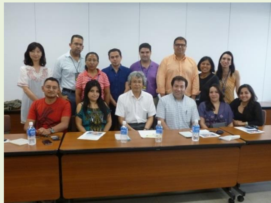
A group photo after a lecture