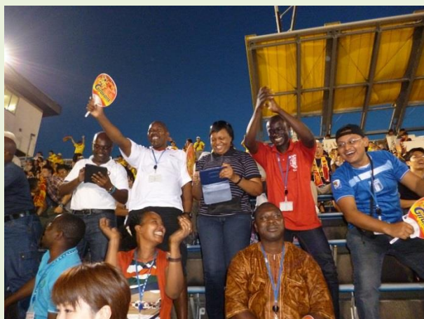
Watching a soccer match on a day off