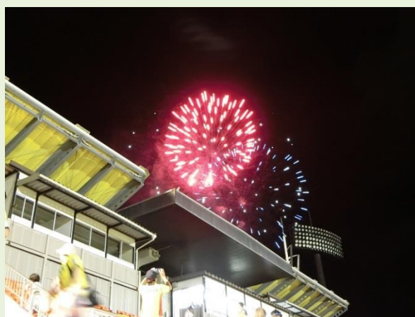
The firework display after the match