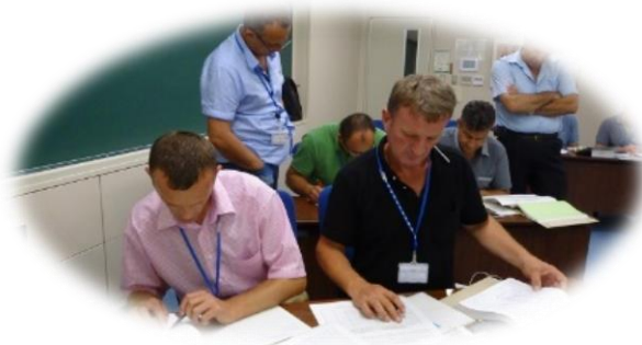
Trainees to take a lecture at the JICA Kyushu (Training course in FY2015)