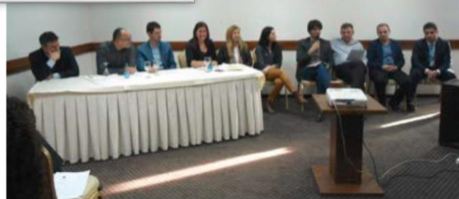
Former participants held a workshop in Kosovo, their home country.