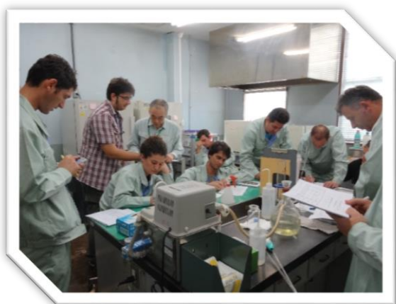
Trainees in water quality inspection exercises (Training course in FY2014)