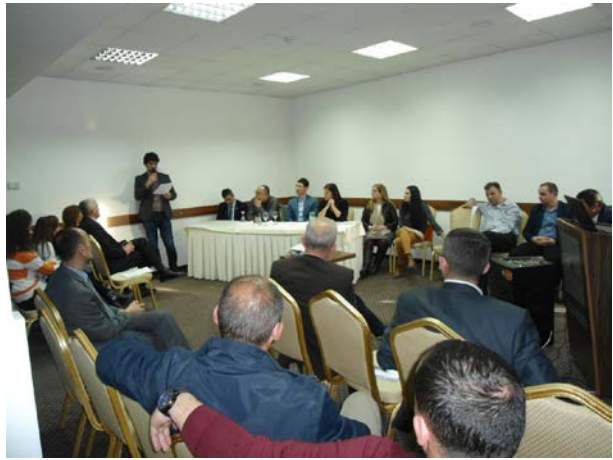
Questioning and answering session moments whereby the participants in the seminar had the chance to discuss closely regarding the experience gained during the training in Japan, and there were made various discussions towards the challenges of water and wastewater in Kosovo.