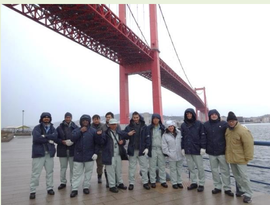
At the Wakato-bridge after, field training