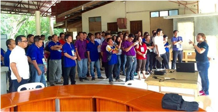
The participant briefing the personnel from the Technical Services Group of ZCWD during the morning assembly on the Operation and Maintenance of Sewerage Systems (B) training in Japan.

The AGM was particularly interested on the action plan that the participant will be making. He was informed that the choice of the action plan was based on its simplicity and actionability within a short period of time (1-2 years). He commented that the presentation to management should focus on the choice of choosing this action plan since the pipe camera system is not anymore a new idea to them. He wanted the participant to also emphasize what the training could contribute to the improvement of the services of the agency.