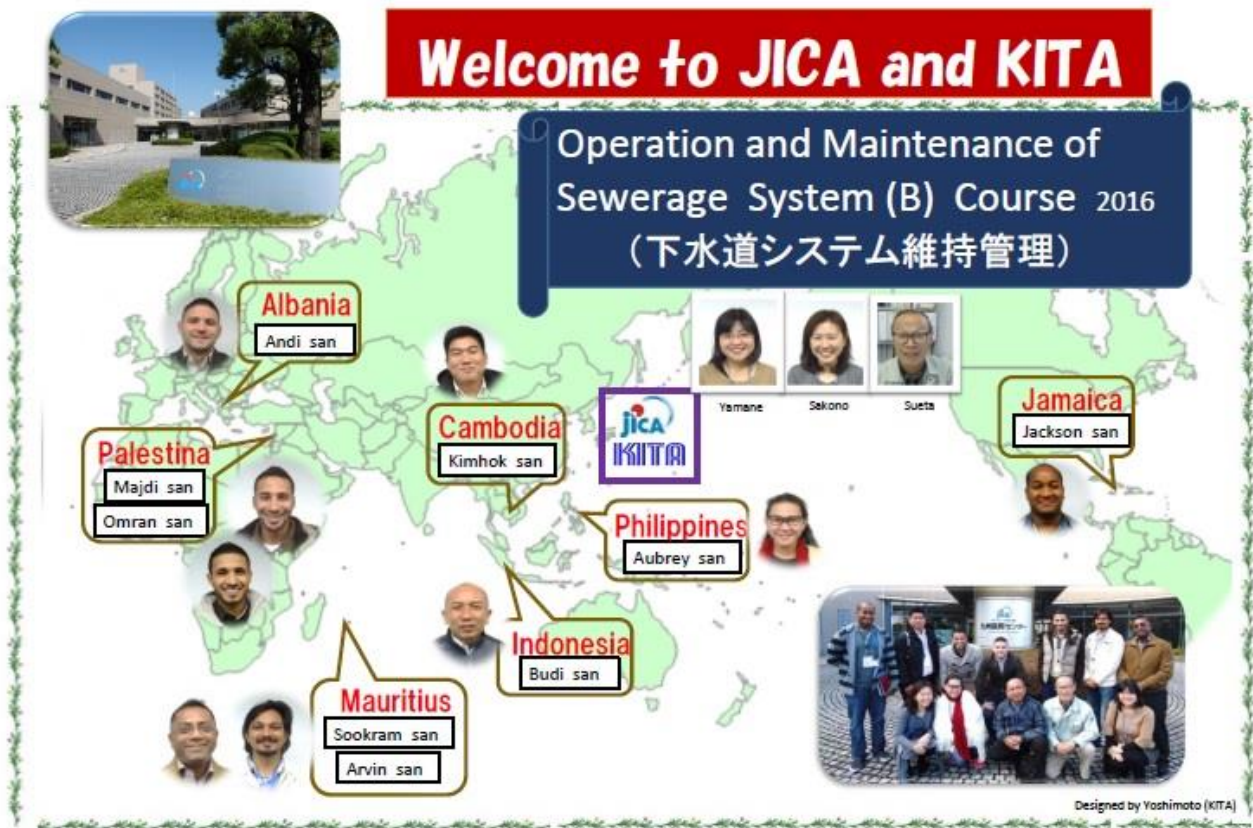
All the trainees dispatched from 6 countries (9 people) gathered in Kitakyushu city.

Hajime SUETA, the course leader who managed the course, introduced us their activity situation.