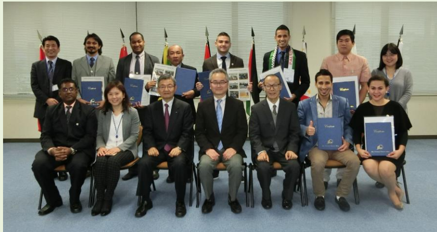
The closing ceremony of “Operation and Maintenance of Sewerage System (B)” course,