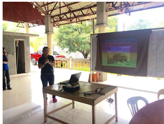
The participant from the Philippines sharing her experience on the 2-month Operation and Maintenance of Sewerage System (B) training course with colleagues at the Technical Services Group of the Zamboanga City Water District on March 28, 2016.