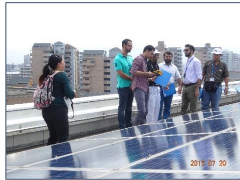
Trainees studying about the solar system